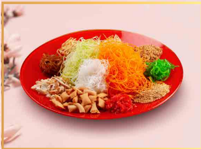
Vegetarian Yu Sheng with Abalone