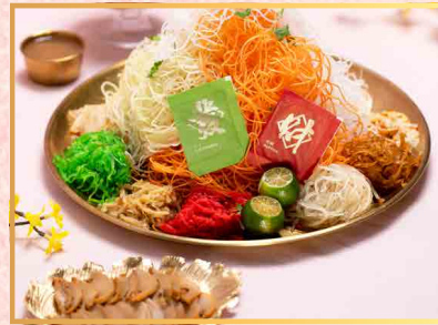
Prosperity Yu Sheng with Abalone

From $888 Onwards: For enquiry please call 6247 9531