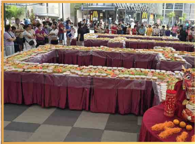
Fortune Loi Hei Yu Sheng

Available from 18 th Jan – 12 th Feb 2025 (Min. Order $380)