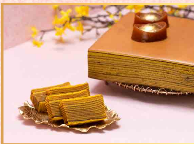
Layered Lapis 8"x8"