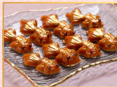
Mini Gold Fish Nian Gao (8 Pcs)