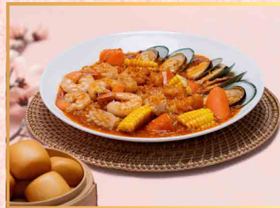
Chilli Crab Sauce Seafood Paired with Deep Fried Mantou