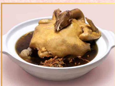
Double Boiled Chicken with Matsutake Mushroom, Cordiceps Flower Mushroom, Red Dates & Fatt Choy