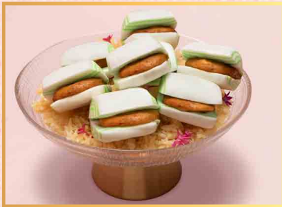
Pandan Mantou Stuffed with Mackerel Otah (20 Pcs)

Available from 18 th Jan – 12 th Feb 2025 (Min. Order $380)