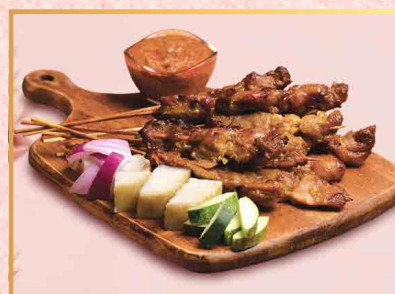
Jumbo Chicken Satay