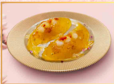
Auspicious Yin Yang Collagen Peach Resin, Osmanthus Koi Fish Jelly (2 Pcs)