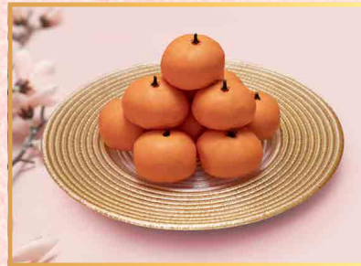
Heng, Ong, Huat, Mandarin Orange Chicken Bak Kwa Bun (12 Pcs)