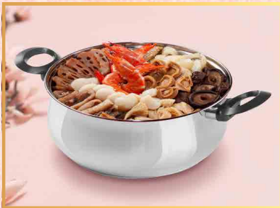
Pot of Abundance Treasure Pen Cai (12 Pax)

10 Head Abalone, Sea Cucumber, Fishmaw, Scallop, Flower Mushroom, Poached Prawn, Fatt Choy, Lotus Root, Yam & Chinese Cabbage