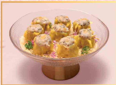
Steamed Truffle Siew Mai (20 Pcs)