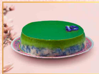
Natural Blue Pea Kueh Salat 8"