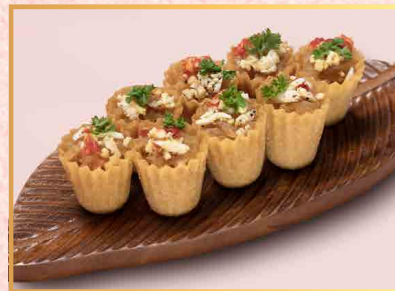
D.I.Y Kueh Pai Ti (50 Pcs)

Served with Braised Turnip, Hard Boiled Egg, Sweet Sauce & Chilli Sauce