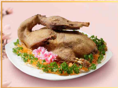
Aromatic Crispy Duck with Zesty Plum Sauce