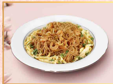
Signature Kampong Fried Mee Siam with Shredded Egg & Chives (10 – 12 Pax)